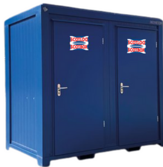
Double Mains Toilet