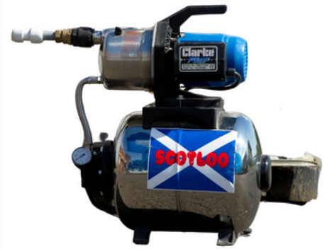
Electric Pressure Pump

250 gallon water storage tanks, for use with toilet units. Replenishment/top-up service available