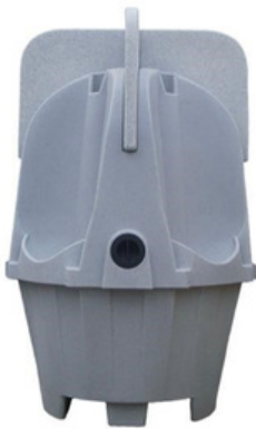
4 Man Urinal Pod