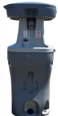
2 Bay Wash Station