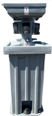
4 Bay Wash Station