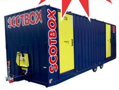
15 Man 24ft Mobile Welfare Unit