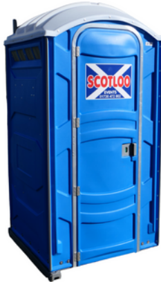
Chemical Hot Water Toilet