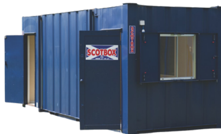
30ft & 32ft Double Office, Kitchen & Toilet