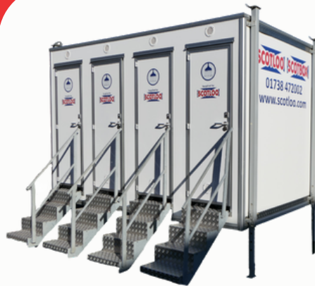
4 Berth Gas Shower