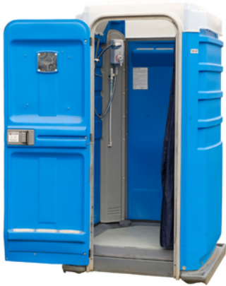
Single Electric Shower