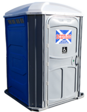
Disabled Access Toilet