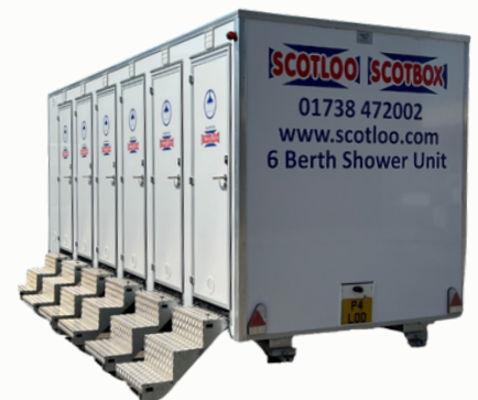
6 Berth Towable Gas Shower