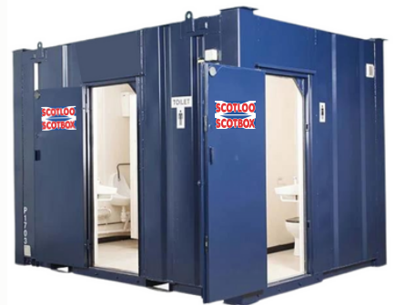
2+1 Mains Toilet Unit