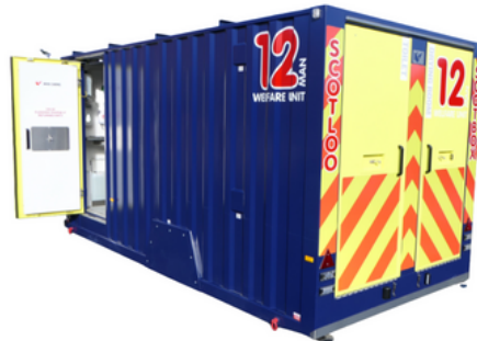
12 Man, 16ft Mobile Welfare Unit