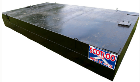
Waste Holding Tank

Waste holding tanks, from 300-1,500 gallon, size dependent on site requirements and toilet configuration