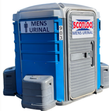
5 Man Urinal Unit