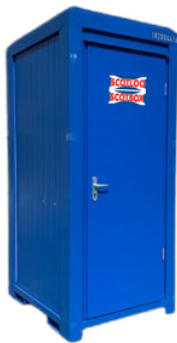
Single Mains Toilet