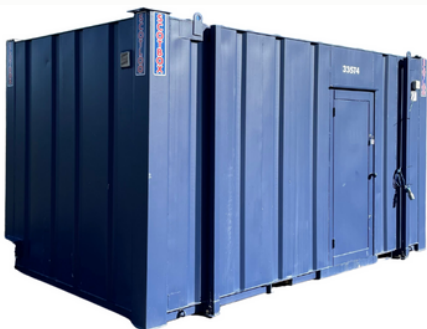
3+1 Mains Toilet Unit