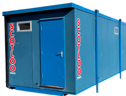
3+2 Mains Toilet Unit