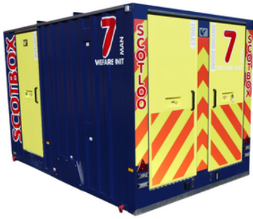
7 Man, 12ft Mobile Welfare Unit