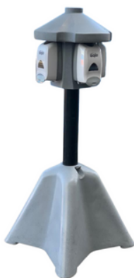
Hand Sanitising Station