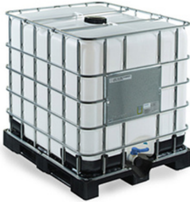
Water Storage Tank

Waste holding tanks, from 300-1,500 gallon, size dependent on site requirements and toilet configuration