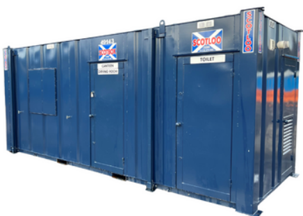
12 man, 20ft Static Welfare Unit

Our multi-use units can be configured to suit your needs. They can be utilised to provide space for an office, canteen, drying room or storage. Each unit can be easily towed to site and can be relocated during your project.